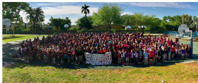
FLAMINGO IS MSD STRONG

Kindergarten parents/guardians are permitted to wait with their child under the pavilion prior to 7:50 a.m. through August 17, 2018.